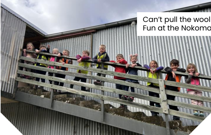
Can't pull the wool over these guys. Fun at the Nokomai wool shed